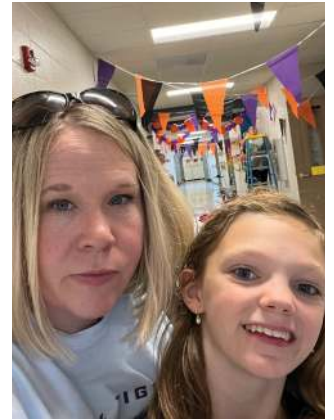
MG is often a helper with Brigitte's many volunteer activities